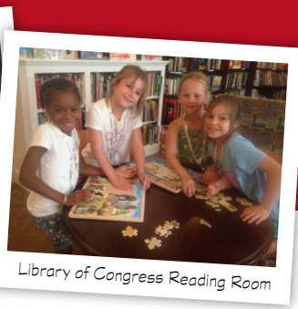
Library of Congress Reading Room