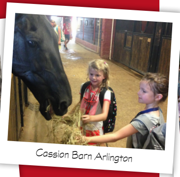
Cassion Barn Arlington