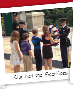
Our National Sacrifices