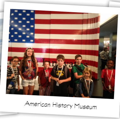
American History Museum