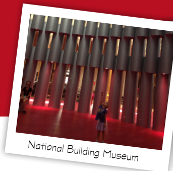
National Building Museum