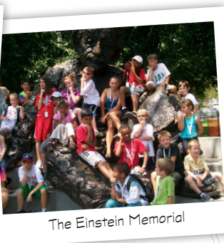
The Einstein Memorial