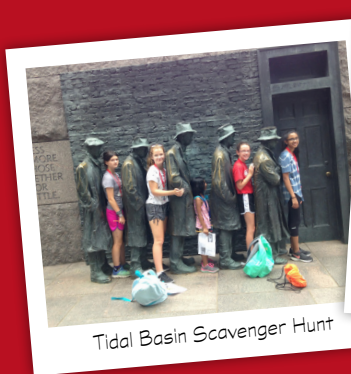
Tidal Basin Scavenger Hunt

The U.S. Capitol sets the stage for A Capitol Experience . Our program is designed to keep kids physically and mentally active through a variety of fun activities and adventures that help them become actively engaged citizens.