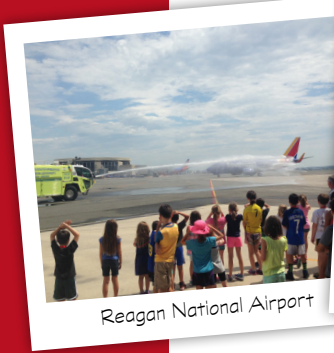
Reagan National Airport

For more information, please contact the Summer Enrichment Program Office at SummerEnrichment@mail.house.gov or 202-225-6100.